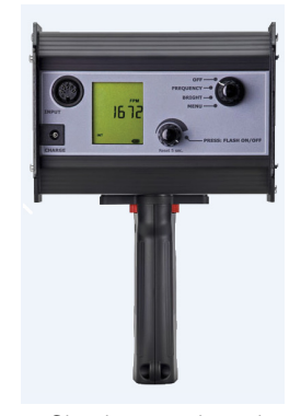
Simple controls and bright, easy-to-read LCD display.